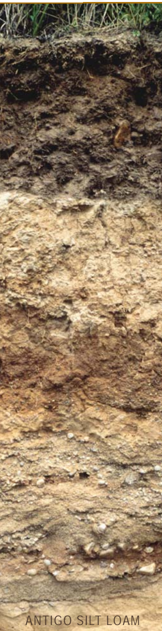
ANTIGO SILT LOAM